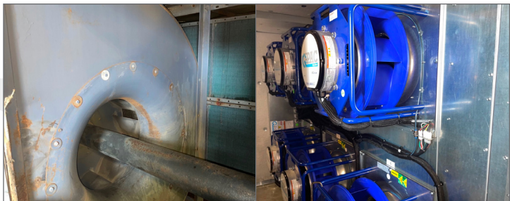
Broken blower wheel removed Fan Array bulkhead wall installed