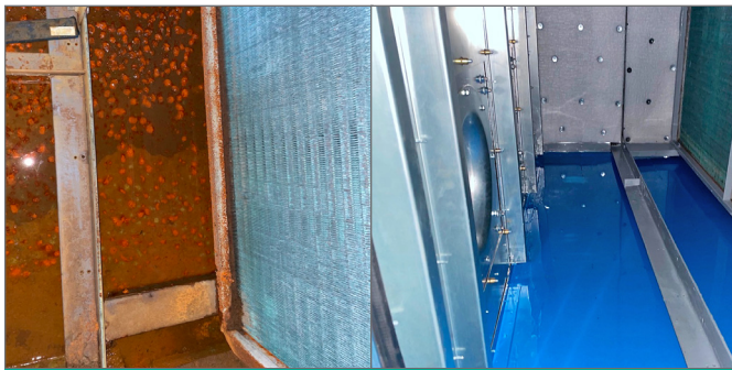
Before New Life