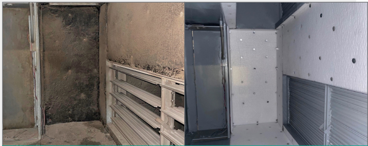
Before PURE-Steam with old insulation Floor Coating, PURE-Cell Insulation