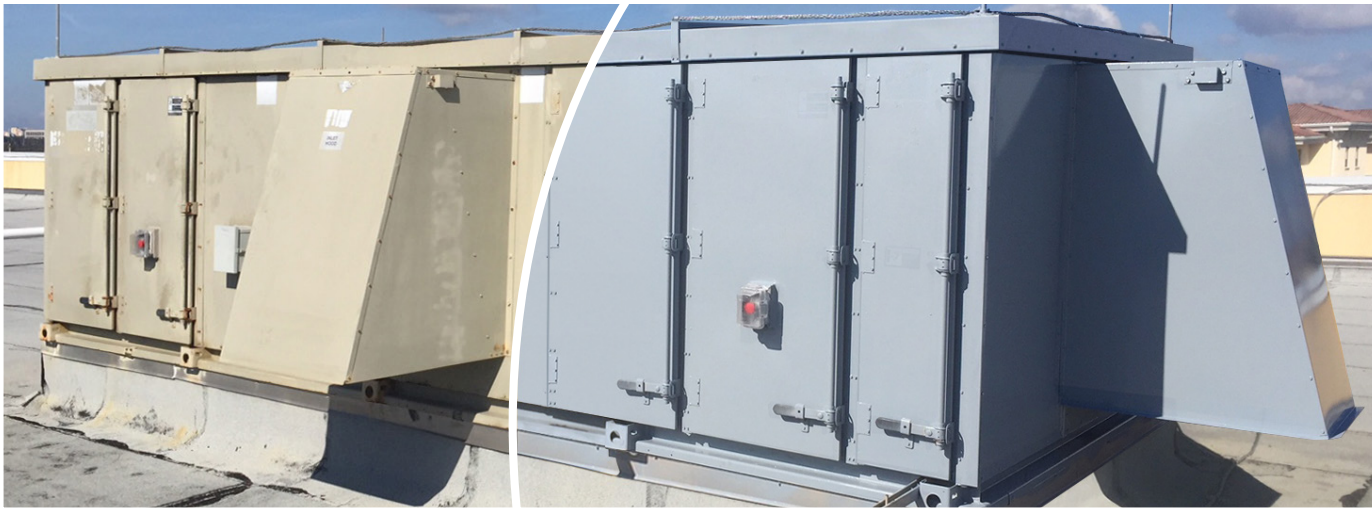
AHU Roof Top Unit After HVAC New Life