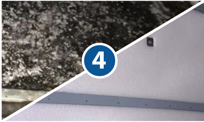
Insulation After PURE-Cell