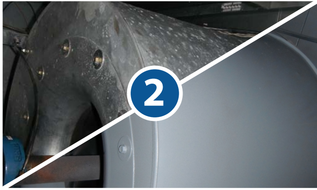
Blower Unit After PURE-Coat