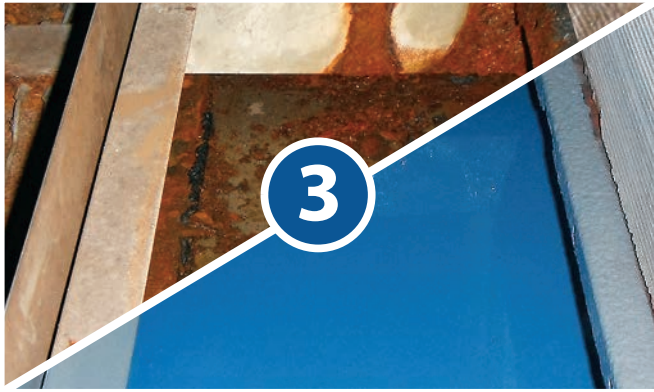
Drain Pan After PURE-Liner