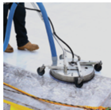
Step 1: Clean with RoofTec™