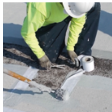
Step 2: Detail with Geogard Seam Sealer