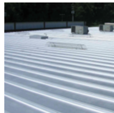
Step 3: Apply One Coat Alumanation 301